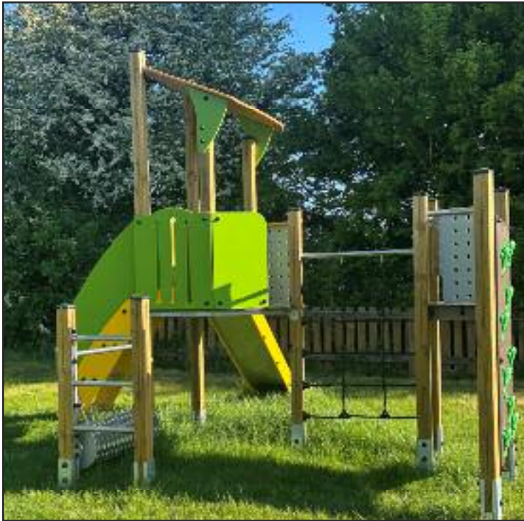
Location: Essex Grant Amount: £30,000

This project to replace the old, dilapidated play equipment at Little Horkesley village playing field was completed following a grant of £30,000 from Enover Community Trust.