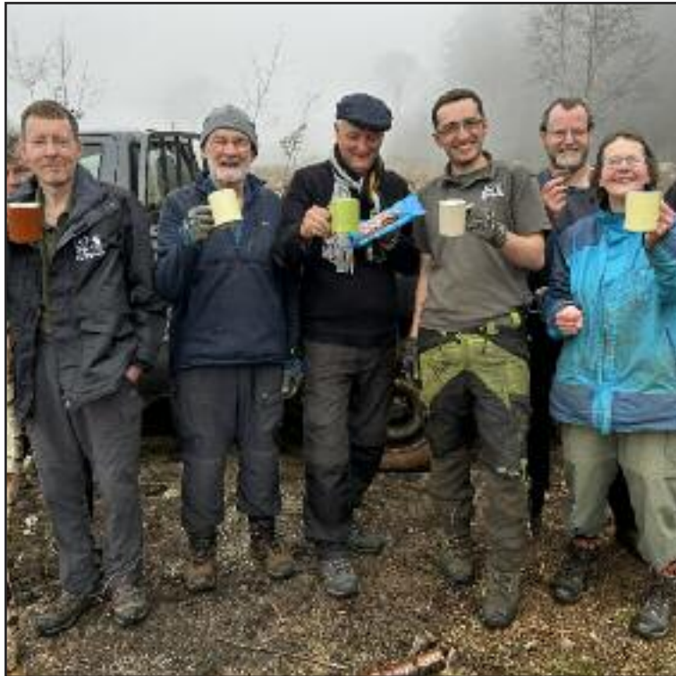
Location: Gloucestershire Grant Amount: £30,234

Gloucestershire Wildlife Trust has completed a project to restore heathland habitats for conservation grazing at two nature reserves in the Forest of Dean, thanks to a £30,234 grant from Enovert Community Trust.