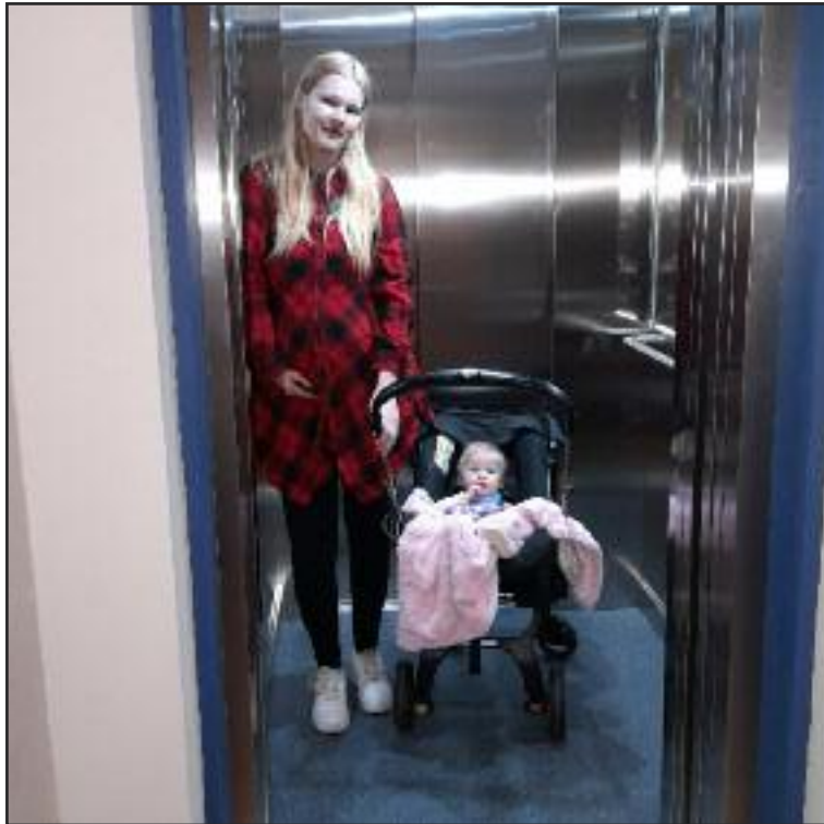
Location: Essex Grant Amount: £35,000

Kingsland Community Centre in Colchester completed a project to improve accessibility to its first-floor facilities thanks to a grant of £35,000 from Enover Community Trust.