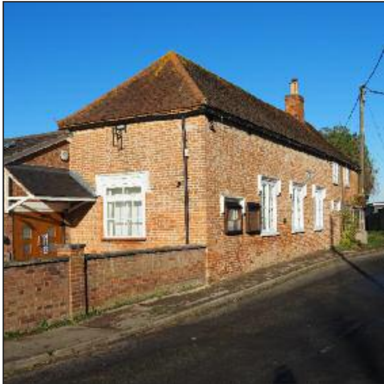
Location: Essex Grant Amount: £16,723

Messing Village Hall, a Grade II listed building dating back to 1748, has been safeguarded for future generations thanks to a £16,723 grant from Enover Community Trust. The project involved extensive repairs to the historic brickwork, ensuring the hall continues to serve as a vital hub for community activities in Messing, near Colchester.