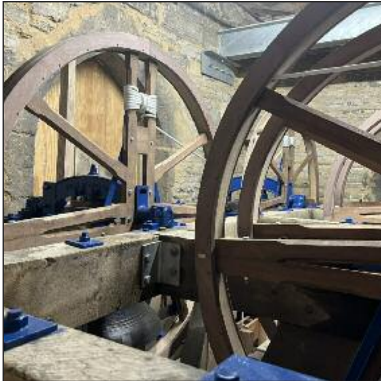
Location: Gloucestershire Grant Amount: £16,500

A project to restore, enhance and promote the bells at St Mary's Church Norton was carried out following a £16,500 grant from Enover Community Trust.