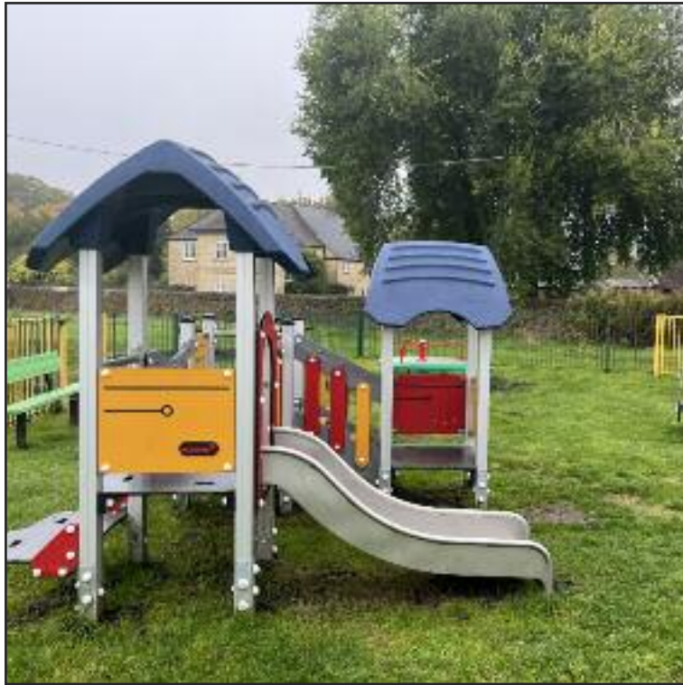
Location: Gloucestershire Grant Amount: £20,000

This project to refurbish the toddler play area in Fairford near Cirencester was completed following a £20,000 grant from Enover Community Trust.