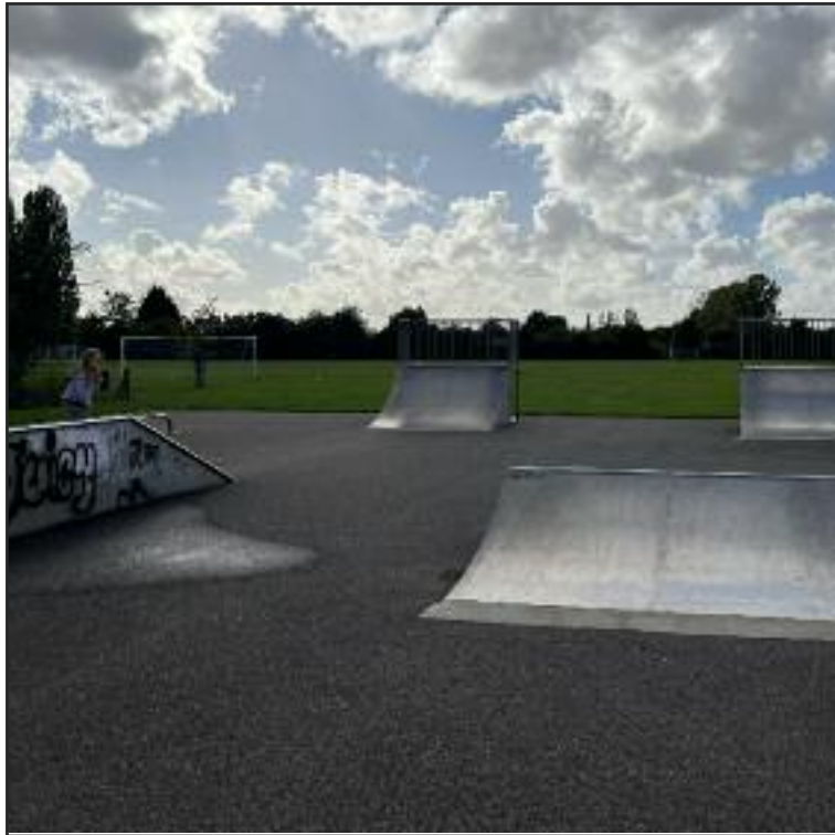
Location: Essex Grant Amount: £35,000

A project to improve the outdoor facilities provided by Marks Tey Parish Council (MTPC) has been completed following a £35,000 grant.