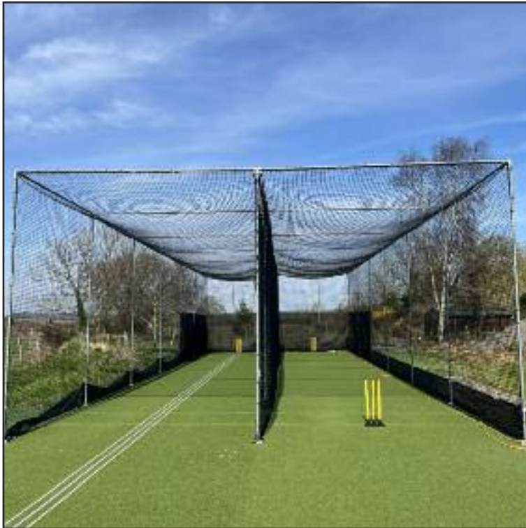
Location: Gloucestershire Grant Amount: £33,882

This project to refurbish the practice nets facility at Kingsholm Cricket Club in Gloucester was completed following a £33,882 grant from Enover Community Trust.